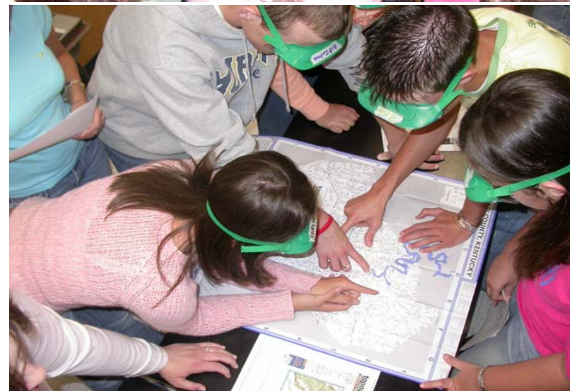
Chemistry students from Adair County High School (Appalachia) performing atrazine immunoassay analyses and mapping the results of collected water samples.